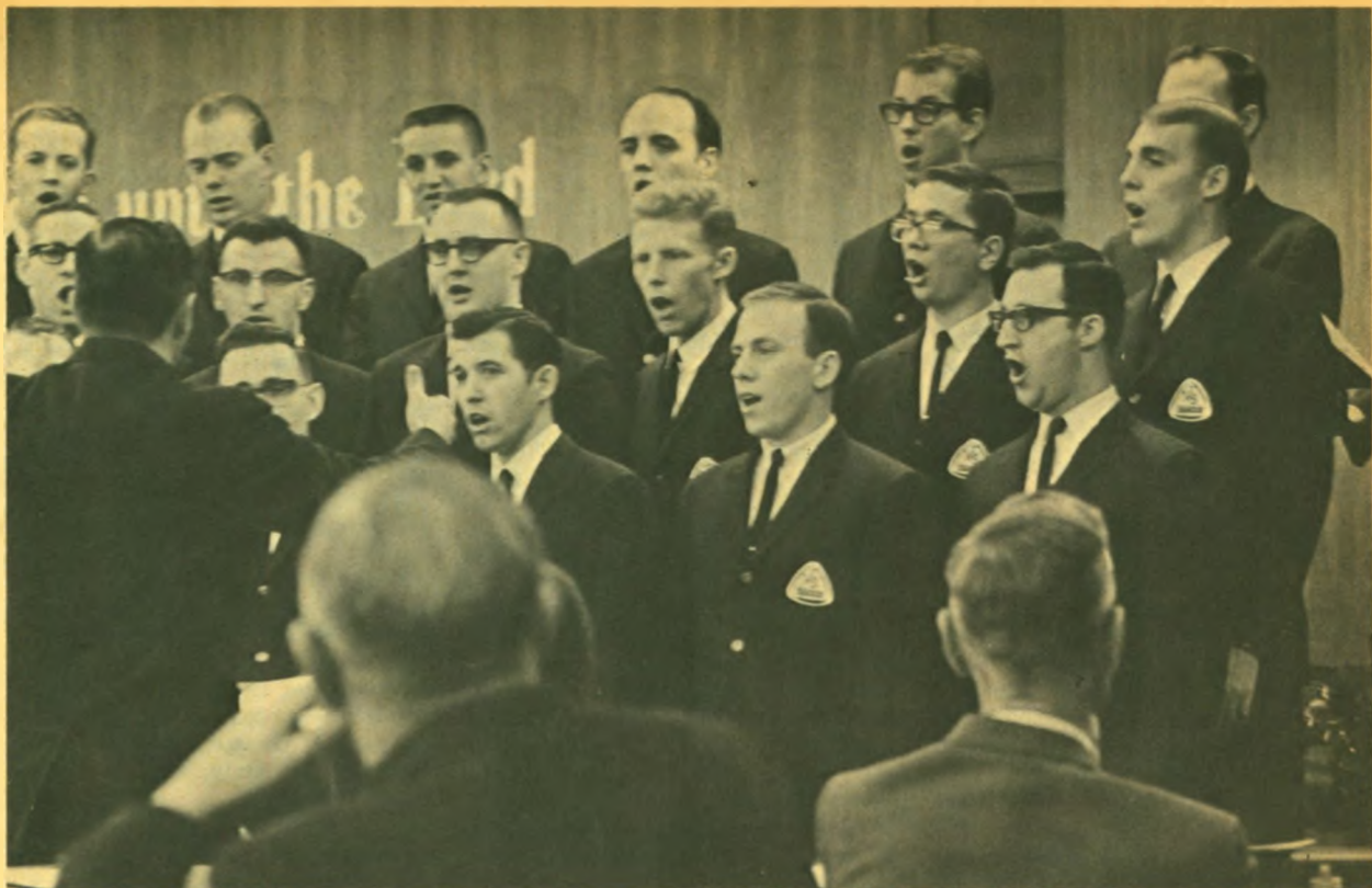
GENERAL BOARD members listen as the Seminary Singers lead in opening devotions